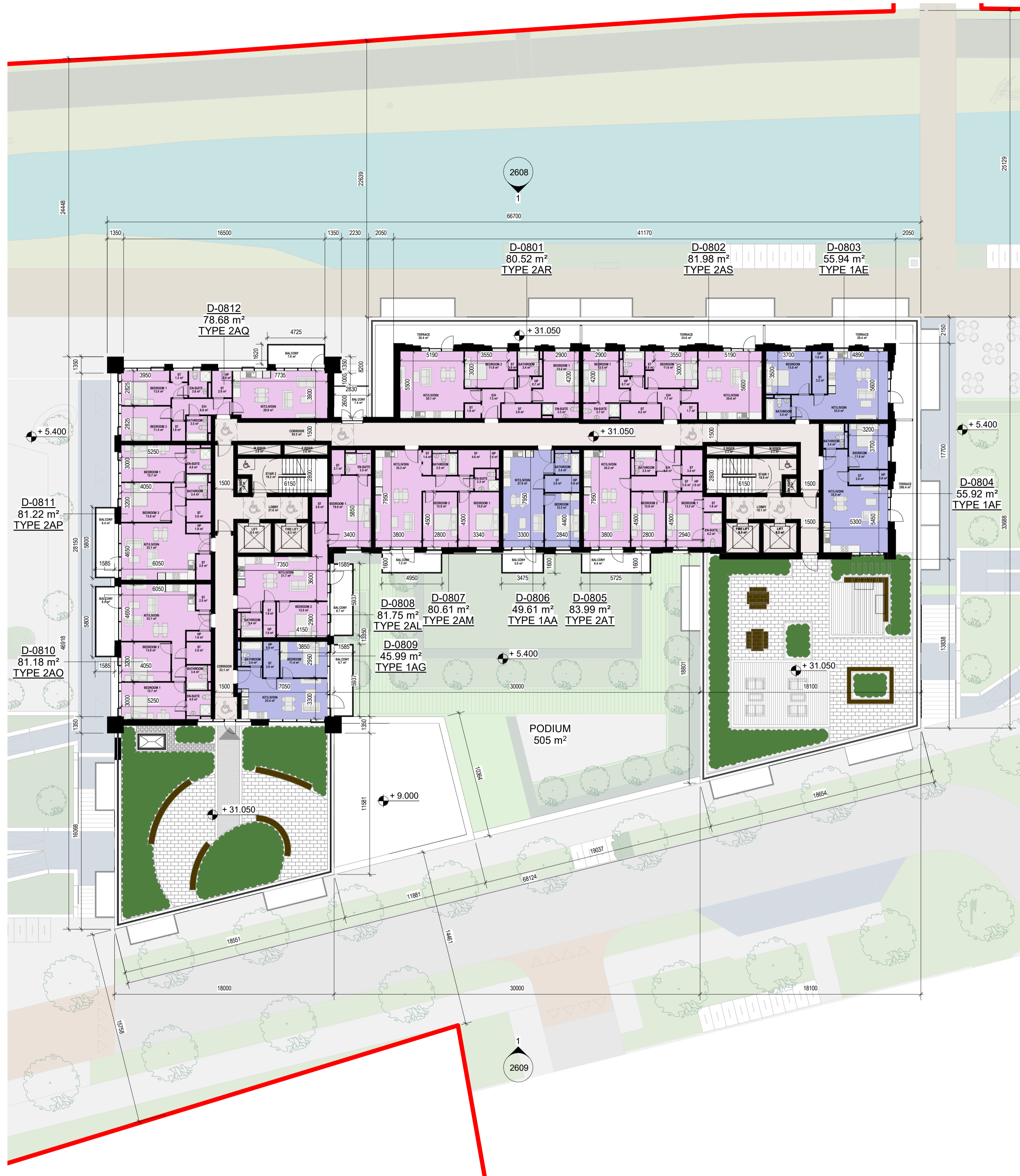
1 PLAN - BLOCK D - LEVEL 08 1:200

Please consider the environment before printing this sheet